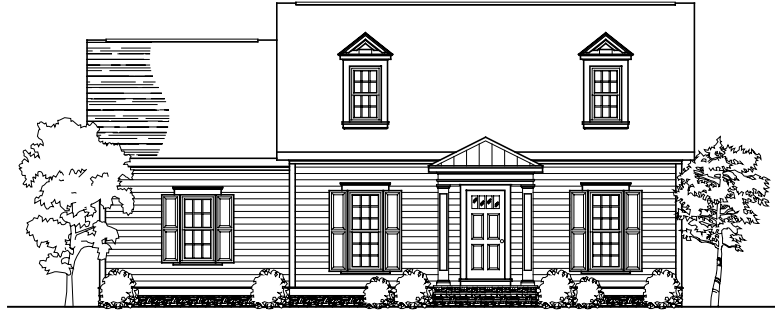
"CREGGER COTTAGE" "COTTAGE STYLE"